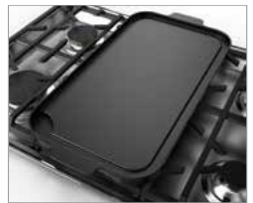
Optional Griddle Accessory