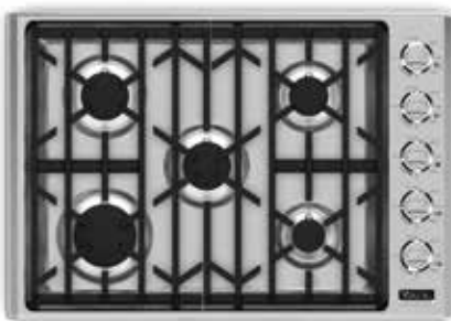
30"W. Gas Cooktop

Designed to fit virtually any existing cutout, Viking Professional Gas Cooktops offer a hassle-free kitchen upgrade with superior cooking power. These surface units strategically deliver all the power you could want from your cooktop, giving you the freedom to not only cook whatever you like, but however you like.